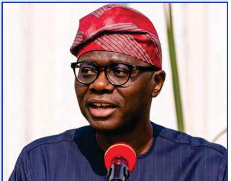
State Governor Babajide Sanwo-Olu

The governor's explanation comes amid criticisms that developments are not commensurate with the huge resources generated in the state.