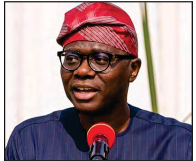
Governor Babajide Sanwo-Olu

"We can see in the last three years we have been doing different phases of extensive renovations because the