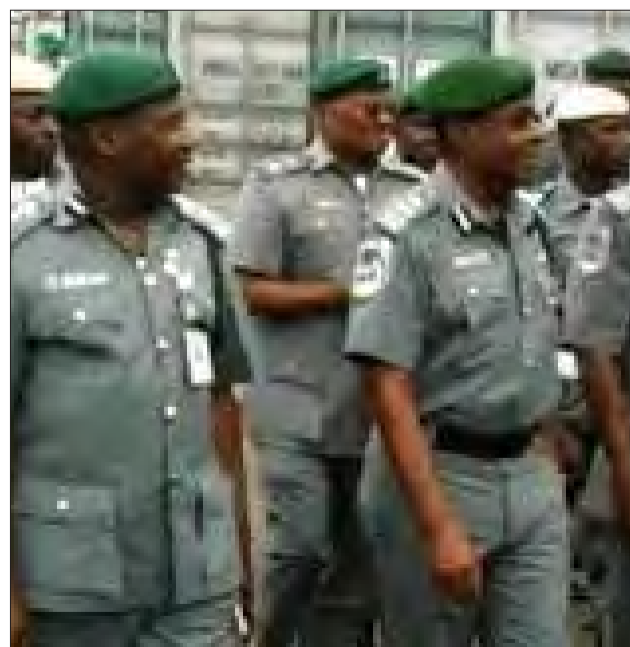
Men of the Nigerian Customs

He said customs operatives under the unit also seized 34,725 litres of petrol, 39 bales of used clothes, and 225 used tyres, among others.