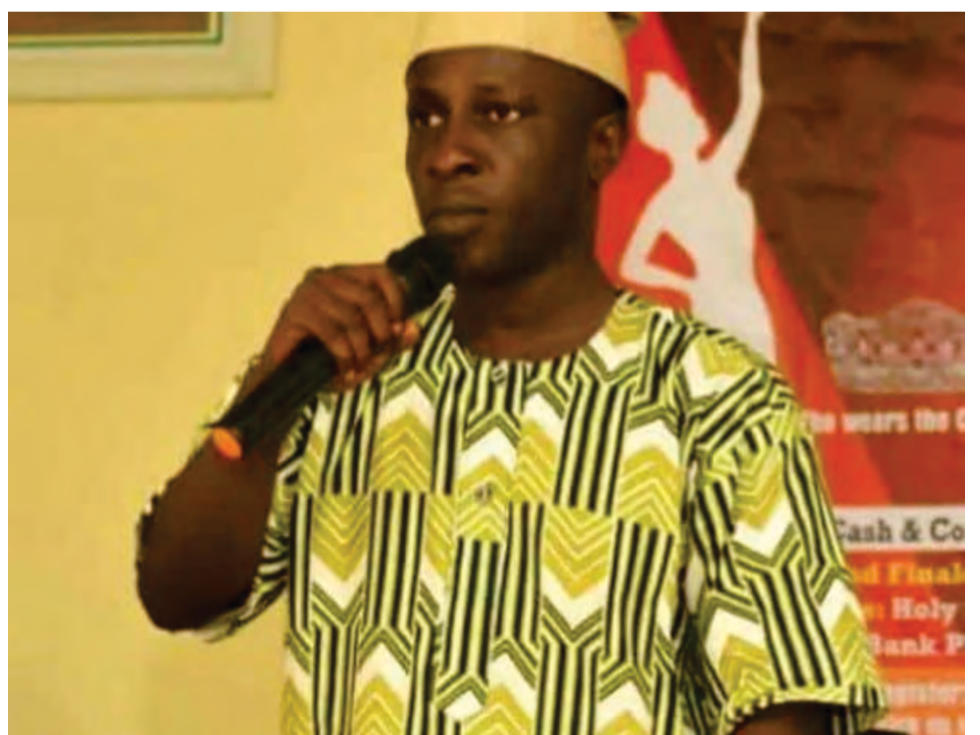
Hon. Abimbola Oshodi

The training is being held at the Local Government Secretariat Mini-Hall at the Legislative Building, Last Floor, 41 Road, Festac.