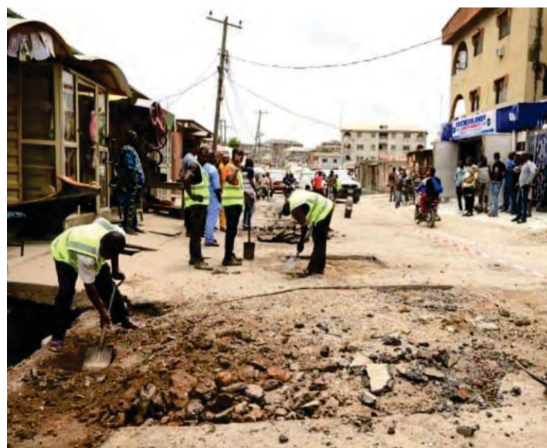
Rehabilitation work in progress

The chairman has vowed not to rest on his oars until Oshodi is given a total facelift.