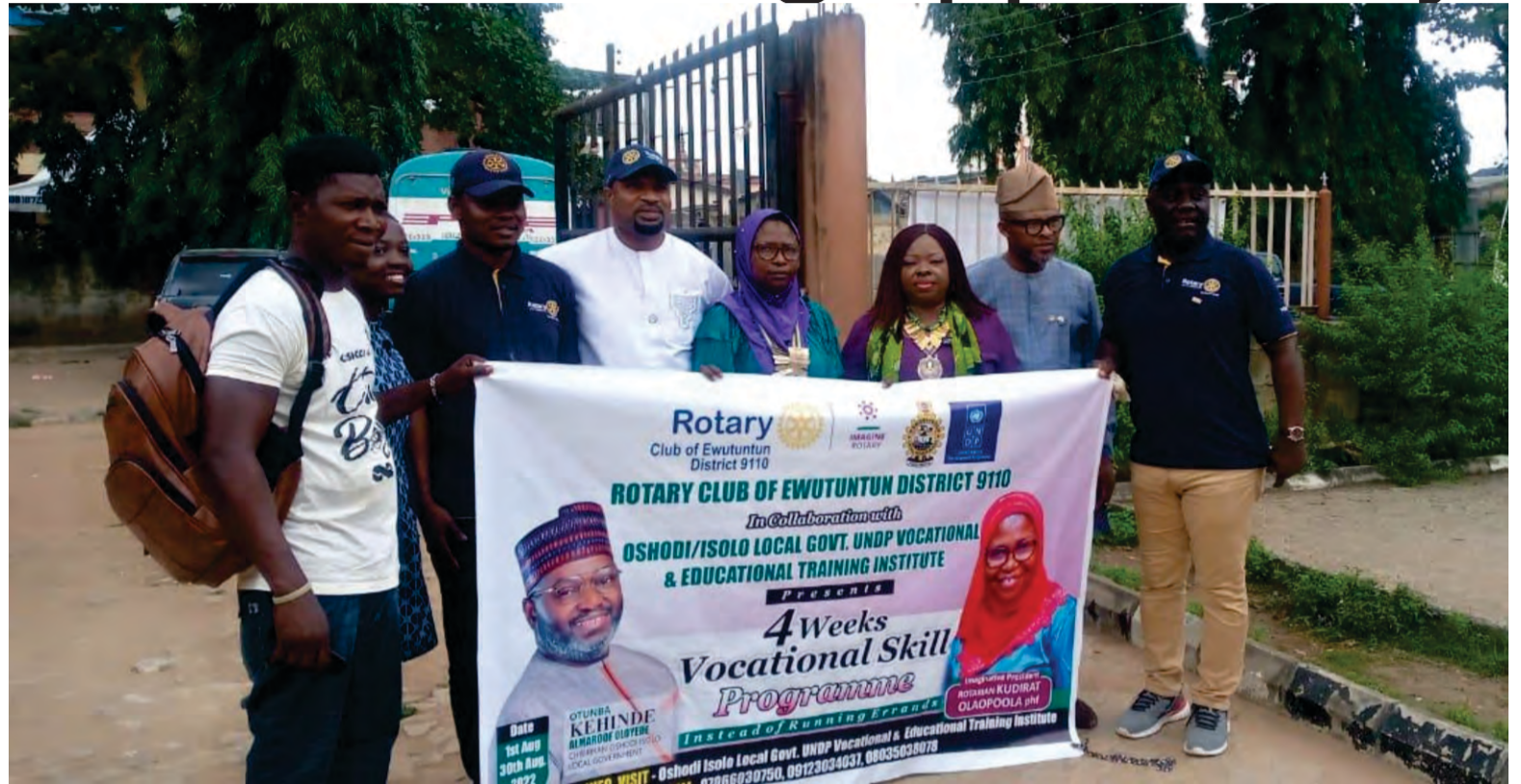
Rotary Club Ewutuntun Oshodi