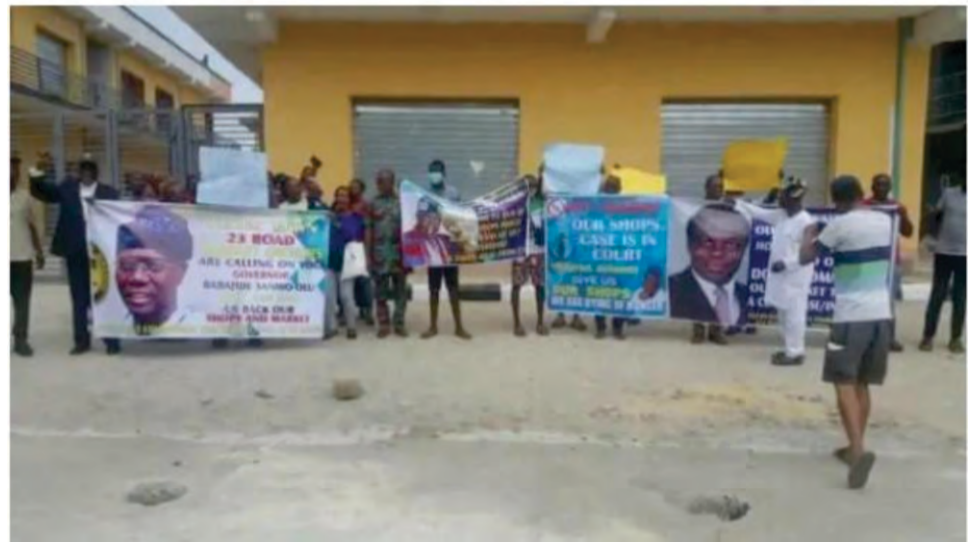
Rotesters in action over Oyinlola Market

N u m b e r ID/9827/LMW/2020 was filed primarily to challenge the defendants from displacing them from their market built by private means as well as to restrain Amuwo Odofin Local Government, the Federal Housing Authority (the actual landlords of the land on which the Market is sitting) and Lagos State Government in the suit from demolishing the Market among other reliefs.