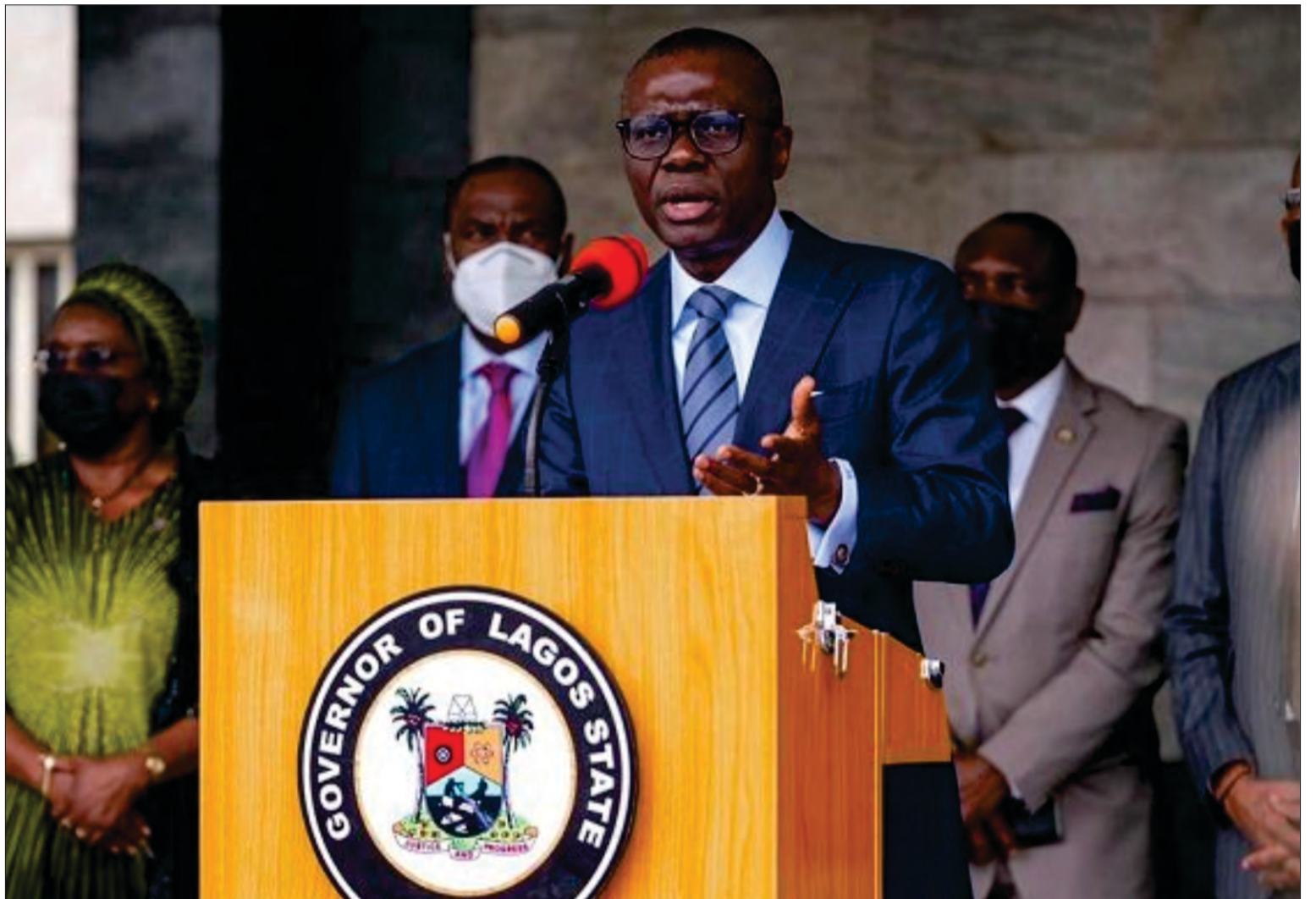
Gov. Babajide Sanwo-Olu

"In just a year, I can say with great confidence that the Lagos Climate Action Plan has started to deliver great and impactful rewards, including attracting the attention of