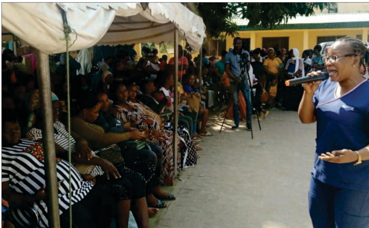
An expert speaking with pregnant women

The over 200 women who participated in the event got baby diapers, detergent, and babe wipes each.