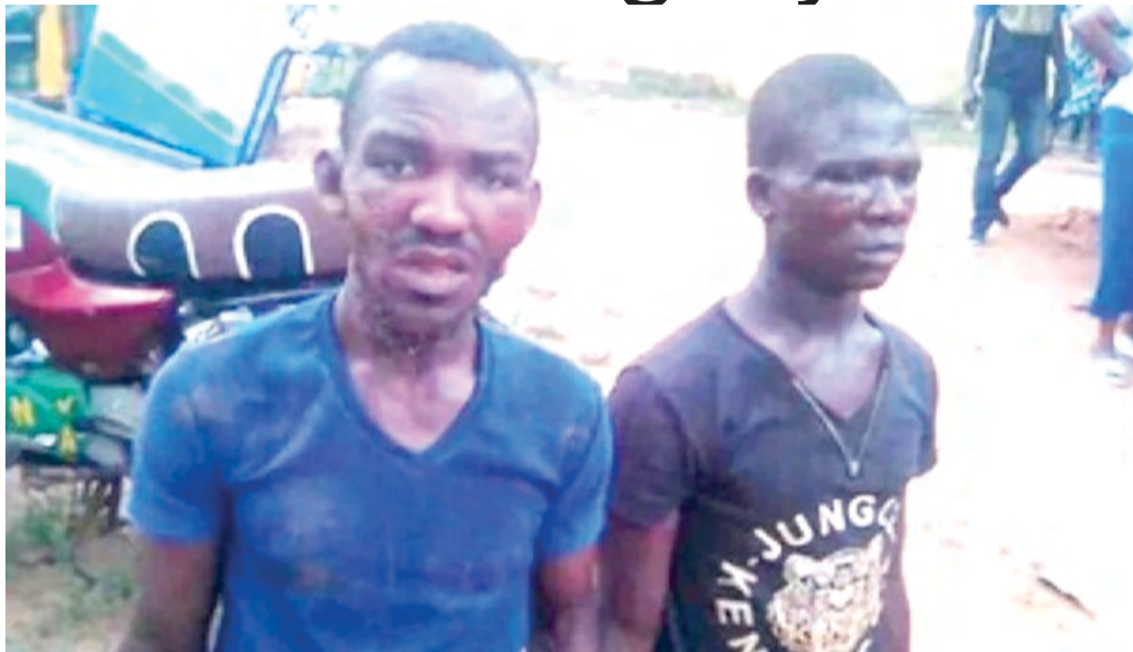
The Pastor and his accomplice