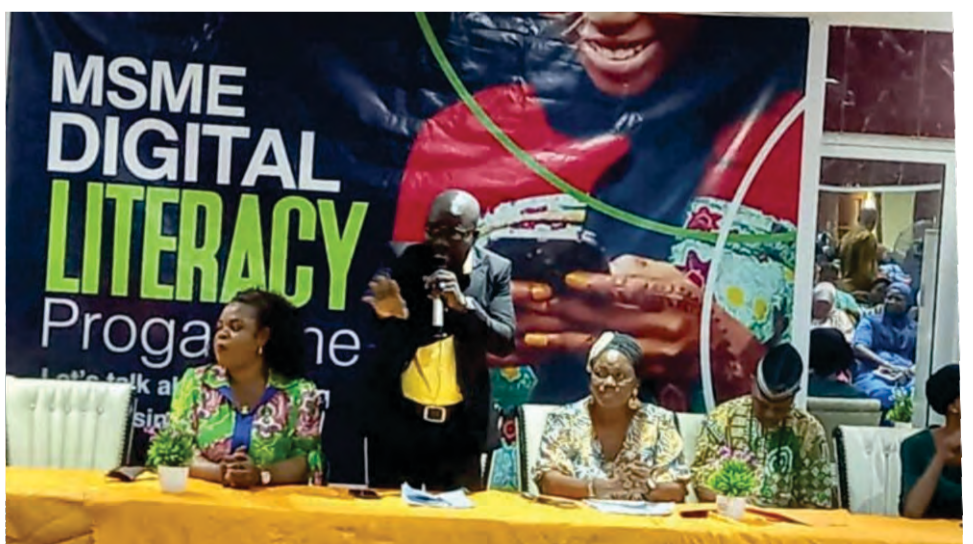
Ibeju-Lekki Local Government executives while sensitizing residents

The council said it would set-up an information desk in partnership with the LSETF where inquiries can be made.